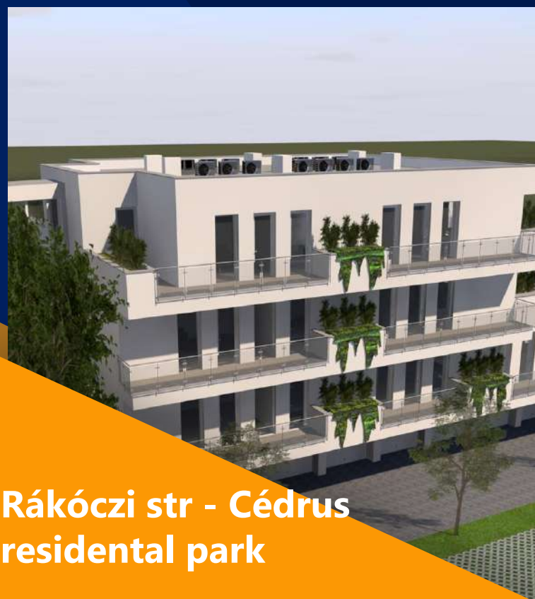
Rákóczi str - Cédrus residential park

Our company is currently building apartments, family houses and semi-detached houses in several parts of the city.